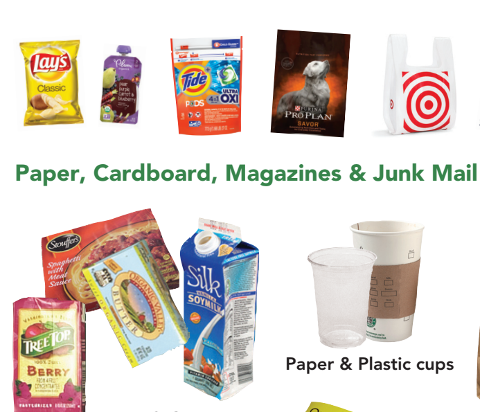
Boxes & Cartons

Please place these types of recyclables in your recycling cart. DO NOT USE PLASTIC BAGS.