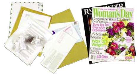
Mail, Magazines, Mixed paper