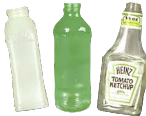
Plastic bottles (all colors)