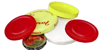
Lids (wider than 3 in.)