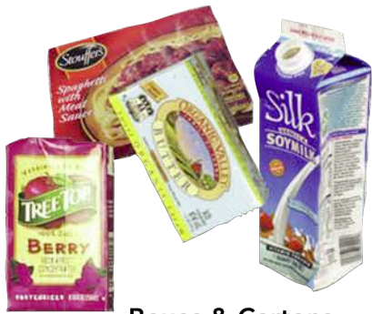
Boxes & Cartons