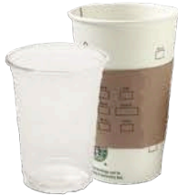
Paper & Plastic cups