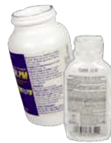
Pill bottles (no prescription vials)