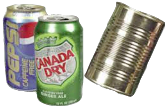
Aluminum & metal cans