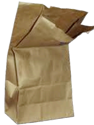
Empty paper bags