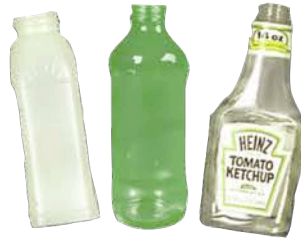
Plastic bottles (all colors)