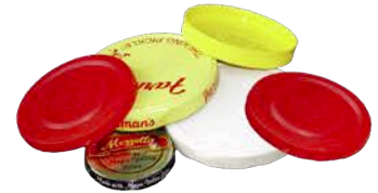
Lids (wider than 3 in.)