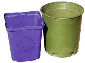
Plastic plant pots