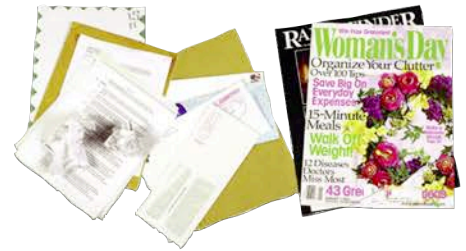
Mail, Magazines, Mixed paper