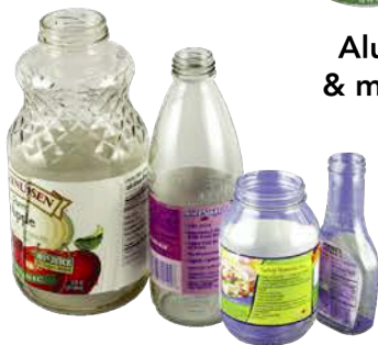
Bottles & Jars