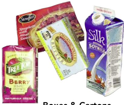
Boxes & Cartons