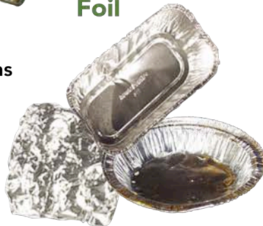
Foil & foil trays (clean)