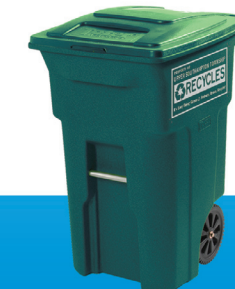
Recycling Collection: Once a week on Friday