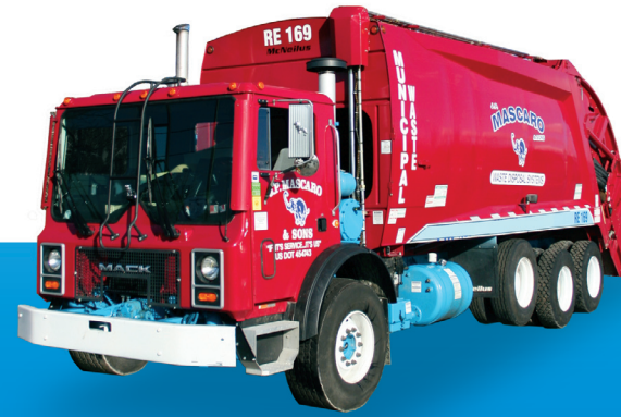
Trash Collection: once a week on Friday