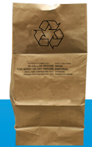
Yard Waste Collection: once a week on Monday (April - Dec 15)