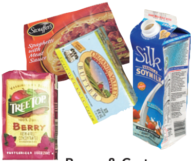
Boxes & Cartons Cajas y Cartones

Papel, Cartón, Revistas Y de correo no deseado