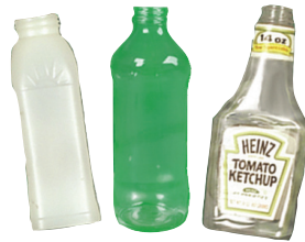
Plastic bottles (all colors) Las botellas de plástico (todos los colores)