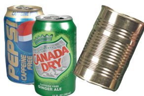
Aluminum & metal cans Latas de aluminio y metales