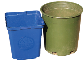
Plastic plant pots Macetas de plástico