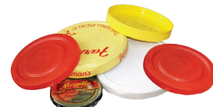
Lids (wider than 3 in.) Tapas (más ancha de 3 pulg.)