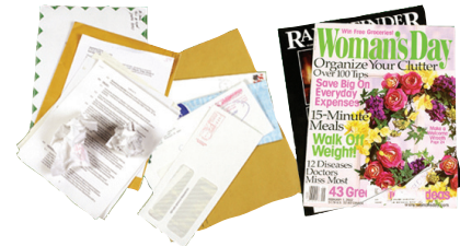
Mail, Magazines, Mixed paper Mail, Revistas, Papel Mixto