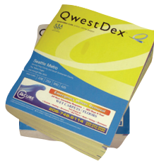
Phone books Guías Telefónicas