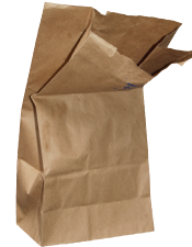
Empty paper bags Bolsas de papel vacías