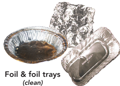
Foil & foil trays (clean)