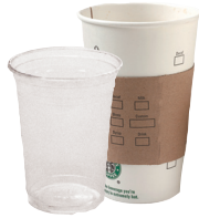
Paper & Plastic cups Productos de papel y de plástico tazas