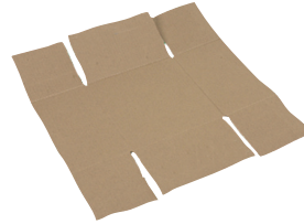
Flattened Cardboard Flattened Cartón