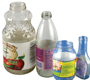
Bottles & Jars Botellas y tarros

Pill bottles (no prescription vials) Botellas de píldora (no recetados viales)